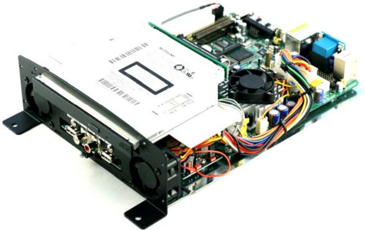
Figure 1.1, bottom mounting plate