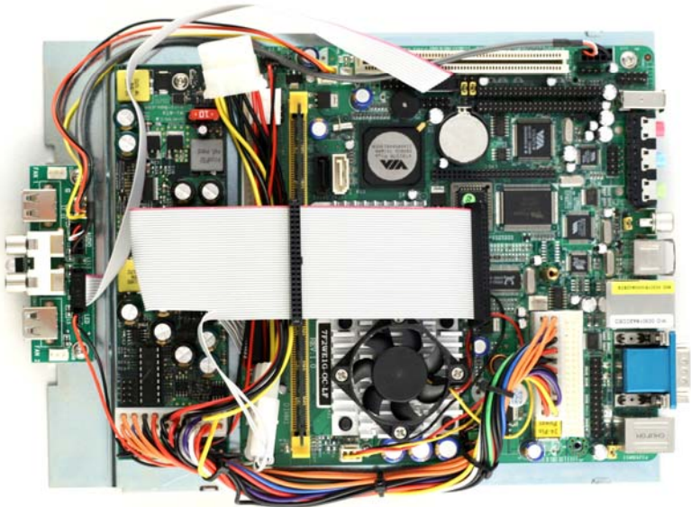
Figure 1.0, bottom mounting plate